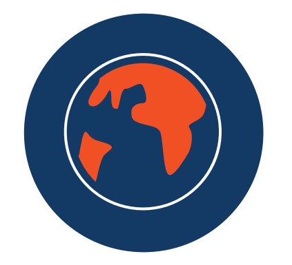
Global market presence