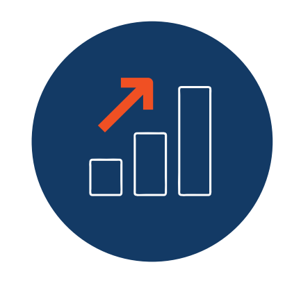
Revenue growth opportunity

Automation Anywhere and the Pinnacle Partner Program provides: